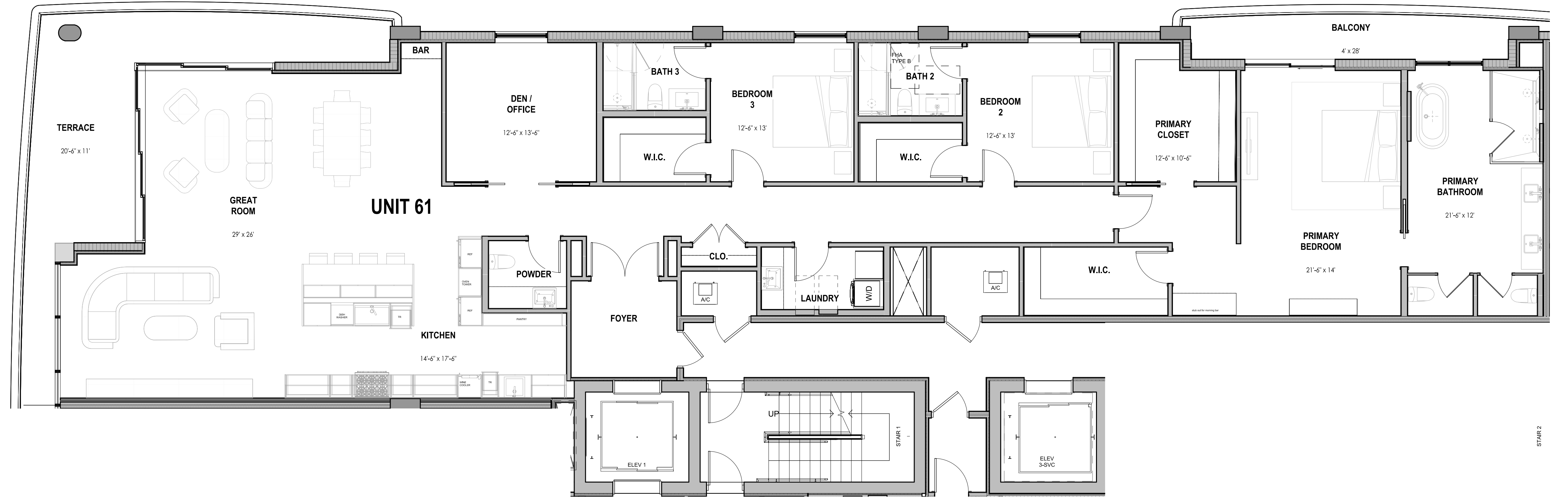
UNIT 61 - TYP. FLOOR (6TH -9TH) 1 3/16" = 1'-0" A-4.06.1-3