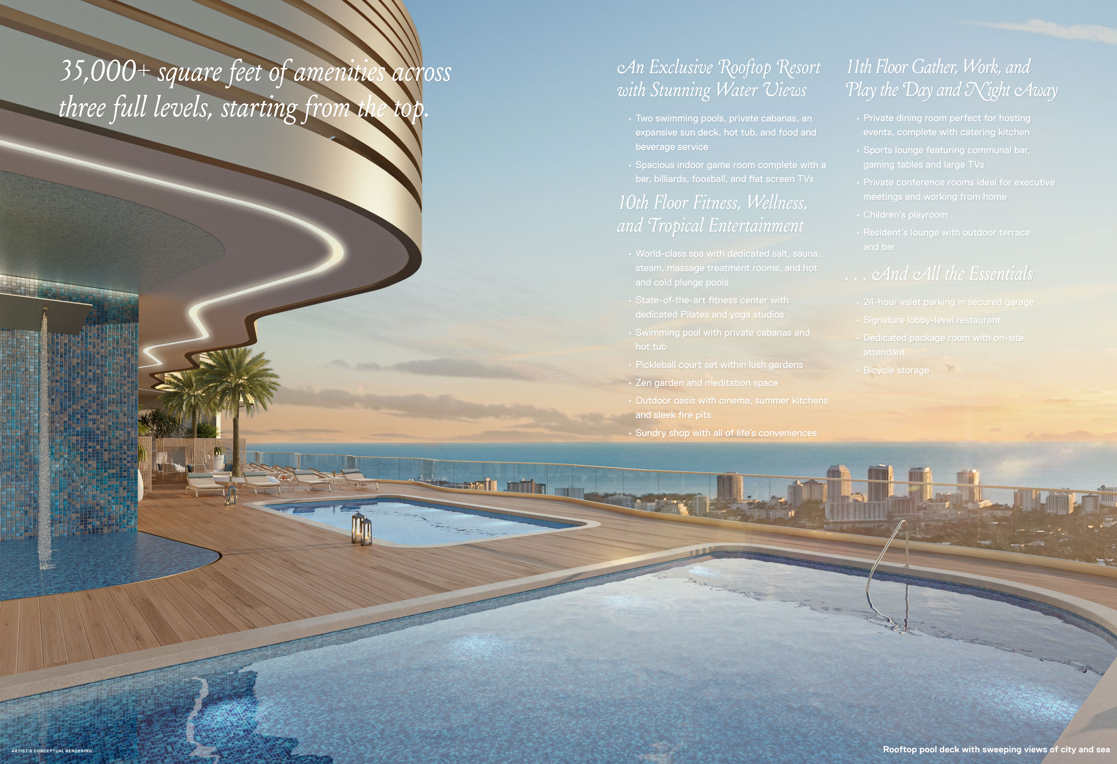
Rooftop pool deck with sweeping views of city and sea