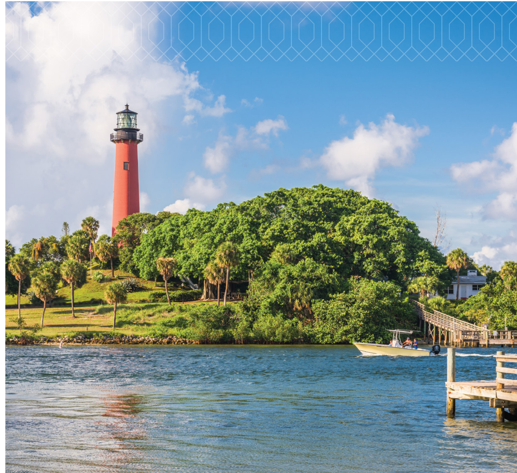
Jupiter Inlet Light House: An icon of Jupiter's Intracoastal Waterway since 1860

The nearby Maltz Jupiter Theatre is undergoing an expansion to accommodate full Broadway scale shows. Charming Downtown Abacoa offers a full calendar of events to enjoy with the family—including a green market, art shows and Spring Training MLB at Roger Dean Stadium.