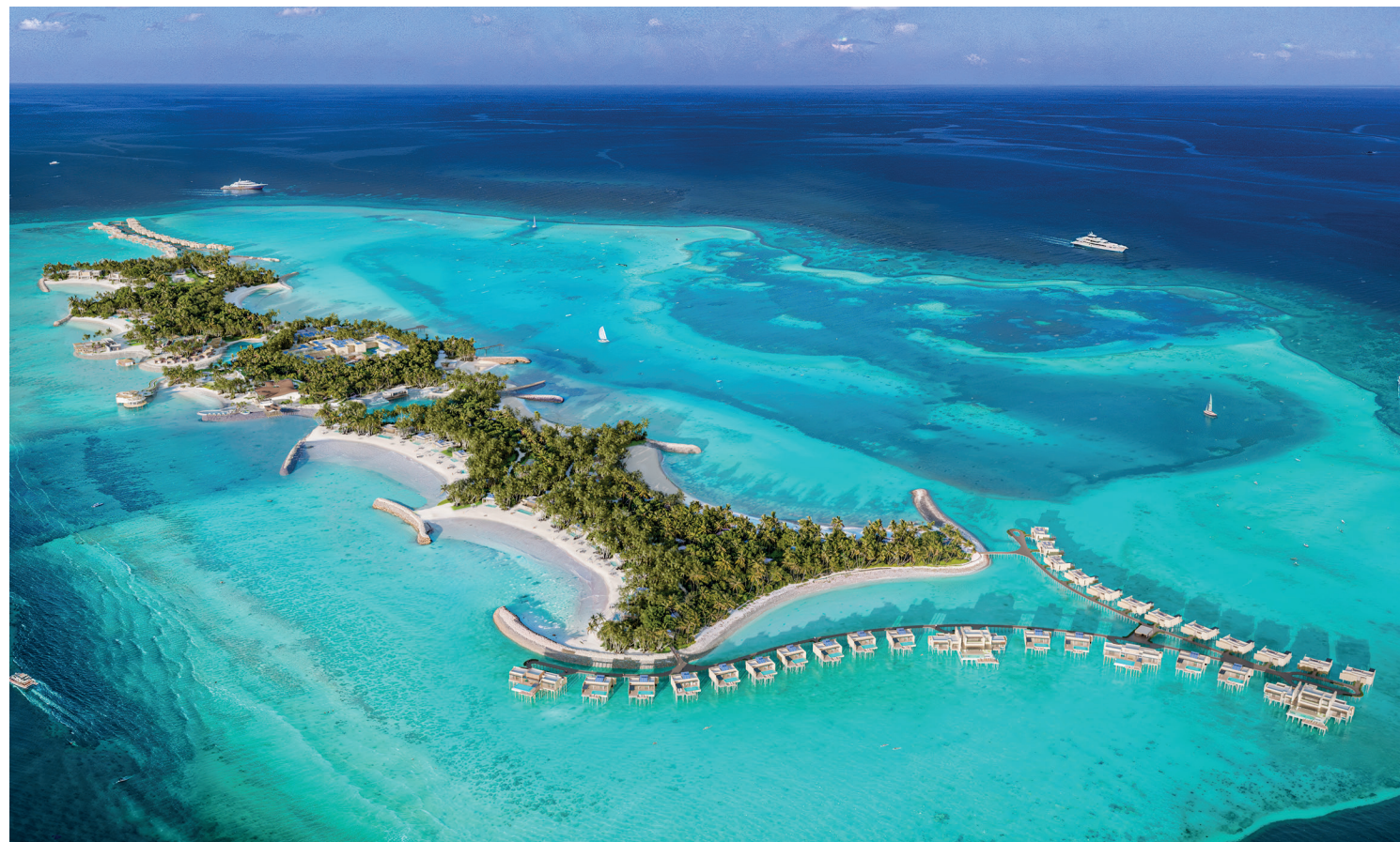
Mandarin Oriental, Maldives

The Delmore in Miami, designed in collaboration with Zaha Hadid Architects, marks its entry into the U.S. market, further expanding its international footprint. Through partnerships with world-renowned brands such as Versace Home, Roberto Cavalli, de GRISOGONO, and hospitality leaders, DAMAC consistently delivers exceptional living experiences and is known for setting new standards in design, architecture and craftsmanship.