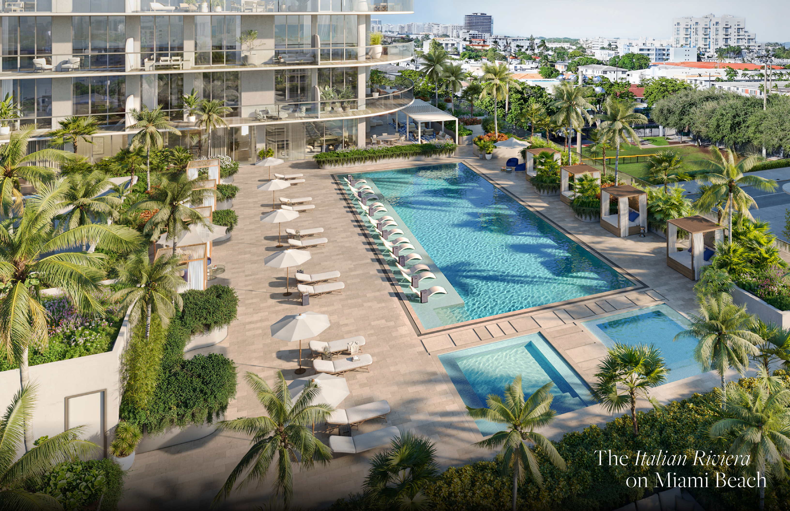
The Italian Riviera on Miami Beach